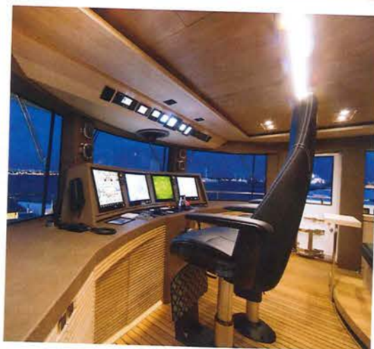
FAR LEFT TO RIGHT: There's plenty to do on the well-appointed sundeck; Light woods and textures grace the interior, even in the wheelhouse; Modish design elements add panache.