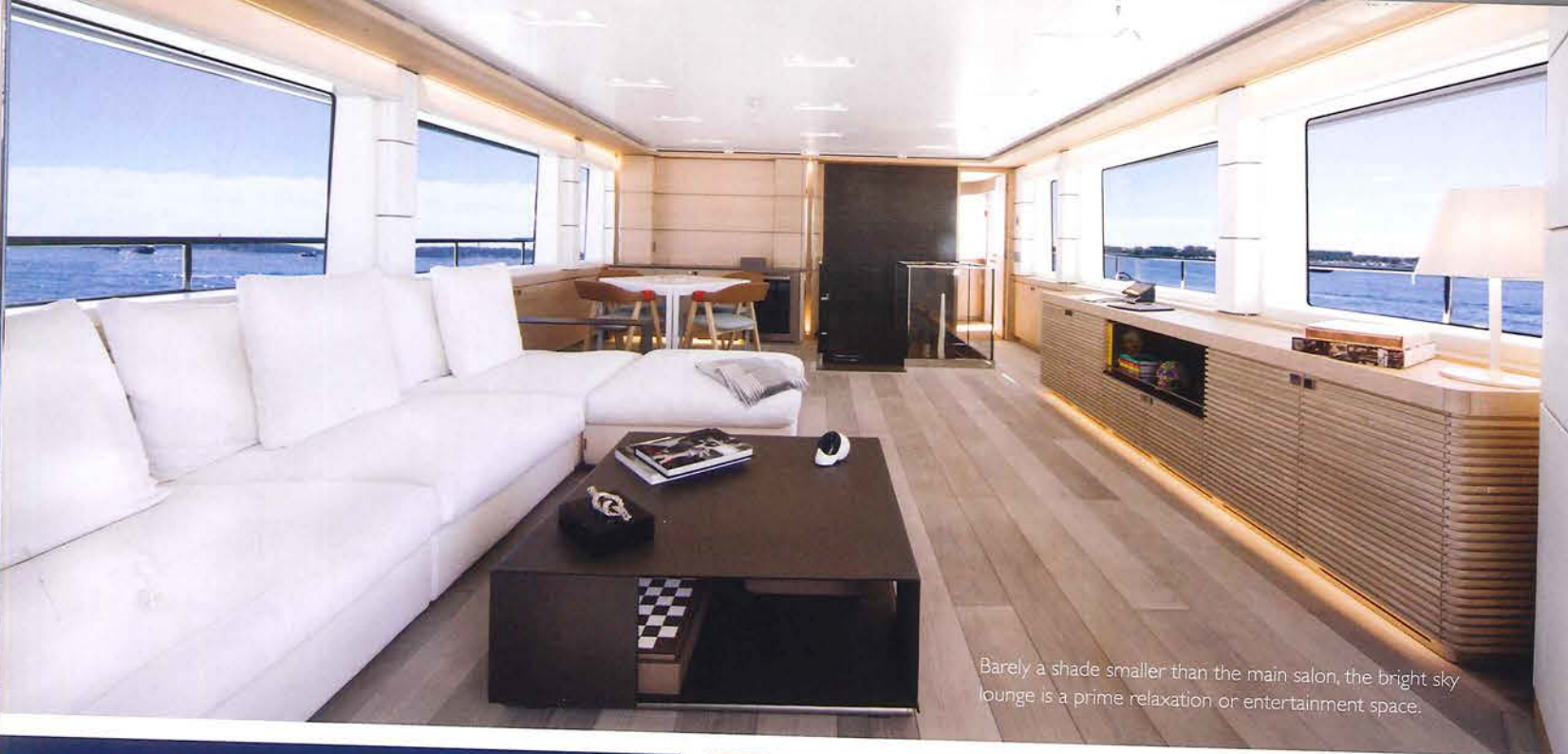
Barely a shade smaller than the main salon, the bright sky lounge is a prime relaxation or entertainment space.